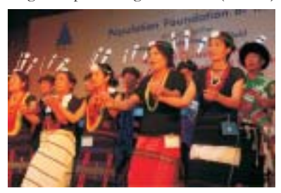
Participants from NNP+ performing at the National Consultation

The consultation started with a beautiful song by the Network of Naga People Living with HIV (NNP+) representing 11 districts of